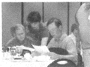
Preparing for a Presentation with Judge Stevenson

TOPICS IN LAST YEAR'S SEMINAR INCLUDED: CHAPTER 7 AND 13 ISSUES, THE REVISED ARTICLE 9 AND LOCAL BANKRUPTCY RULES, BANKRUPTCY BASICS, THE PC AND YOUR PRACTICE AND OTHER TOPICS. THE AGENDA FOR THIS YEAR IS STILL IN PROCESS, BUT LOOK FOR IT TO BE JUST AS TIMELY. IN ADDITION ITS EDUCATIONAL FEATURES, THE SEMINAR ALLOWS US THE OPPORTUNITY TO GET TO KNOW EACH OTHER BETTER, MEND FENCES IF NECESSARY AND JUST HAVE FUN. HERE ARE SOME PICTURES FROM LAST YEAR'S SEMINAR: